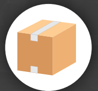
TOP & BOTTOM SEAL