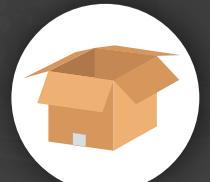
BOTTOM SEAL ONLY